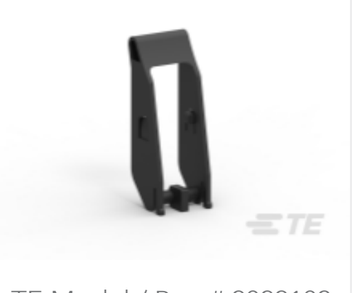
TE Model / Part # 2022103-